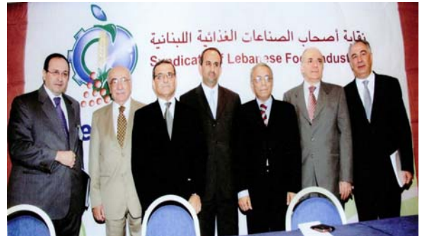
MEFOSA GM with Speakers and Organizers