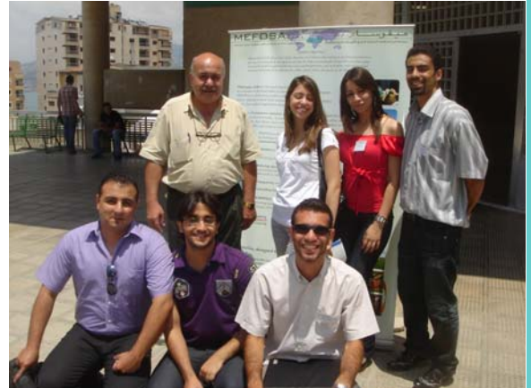
MEFOSA Services & Sales Team

Simultaneously, the department focuses on research; specifically how to transform science into policies thus solutions. Several projects and workshops are being both, participated in and conducted by us. The themes vary: Solid waste management, water sustainability, climate change, food safety from the agriculture perspective, Nitrate pollution and how it is affecting the environ-