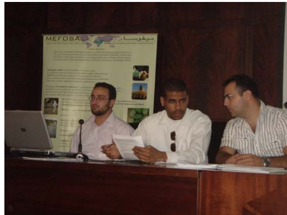
MEFOSA IT Team

MEFOSA's IT Dept, that deals with traceability in the farming sector as well as Farm Management Solutions (such as AgData) conducted a conference related to this area of business at the Chambers of commerce and Industry of Beirut. During this conference we elaborated on how farming has changed over the past 100 years from a means of sustenance to a commercial and national protective issue. We also elaborated how agriculture has changed into a modern activity by usage of software applications to assist on the running of a farming enterprise. Software such as AgData helps farmers to accomplish this task more effectively and efficiently. AgData consists of different modules such as Cropping, Livestock, Mapping, Weather and Financials that help in tracking all activities in the farm as well as managing these activities to the best of the farmer's abilities. We also had a presentation on how to better improve the quality of produce in the viticulture sector, through monitoring all aspects of field production with the use of AgData. Knowing that the quality of the final produce (wine for example) doesn't depend on the type of grapes or the blend of grapes used but the character of the wine's vine yards, the combination of soil climate and exposure to sun.