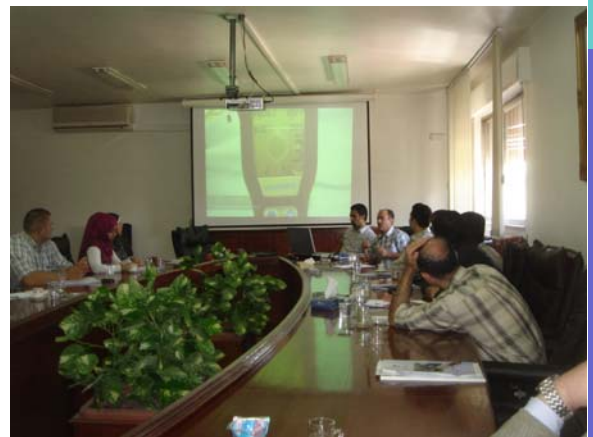
MEFOSA presenting in Jordan